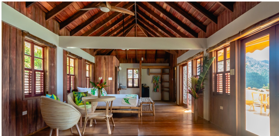
Full Luxury Eco-Villa – 800sq ft / 74m 2