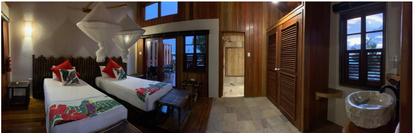
Eco-Villa Room Twin: 400sq ft / 37m 2