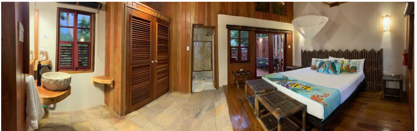
Eco-Villa Room King: 400sq ft / 37m 2